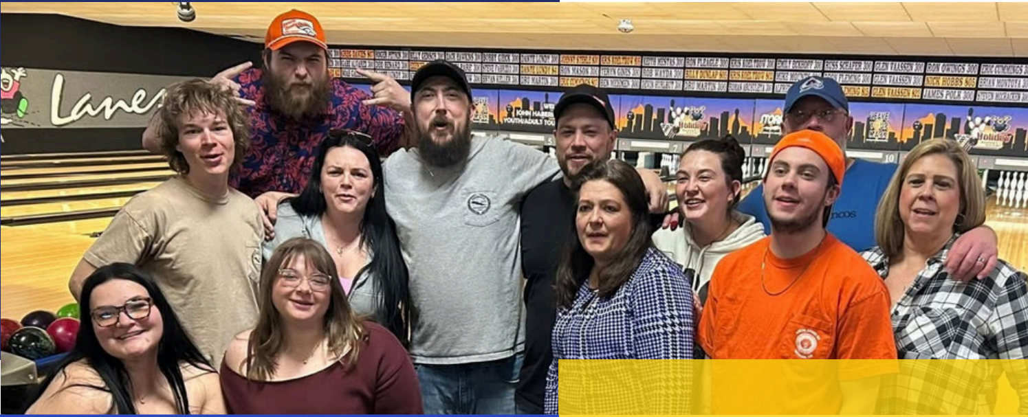
The Denver Joint Electrical Apprenticeship Staff entered the 25 th Annual Bowling Tournament as a team!