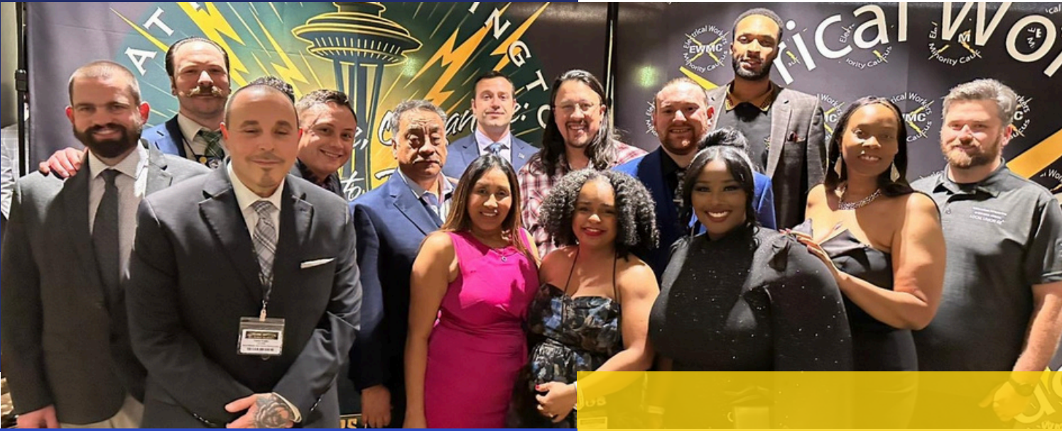
36 th EWMC National Leadership Conference