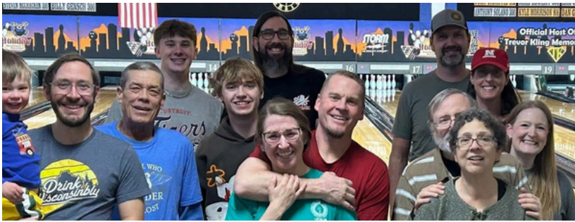
The 25th Annual Wireman's Brotherhood Benefit Fund bowling tournament was a raging success. Hope to see you next year!

Holiday Bowling and Billiards in Lakewood was host to 141 bowlers as well as plenty of family and friends. It was a great opportunity to bond with brothers across the local and share in some friendly competition and great food. With all of the demands of our jobs and lives, this event was an important reminder of the bonds we share exclusively through the brotherhood.